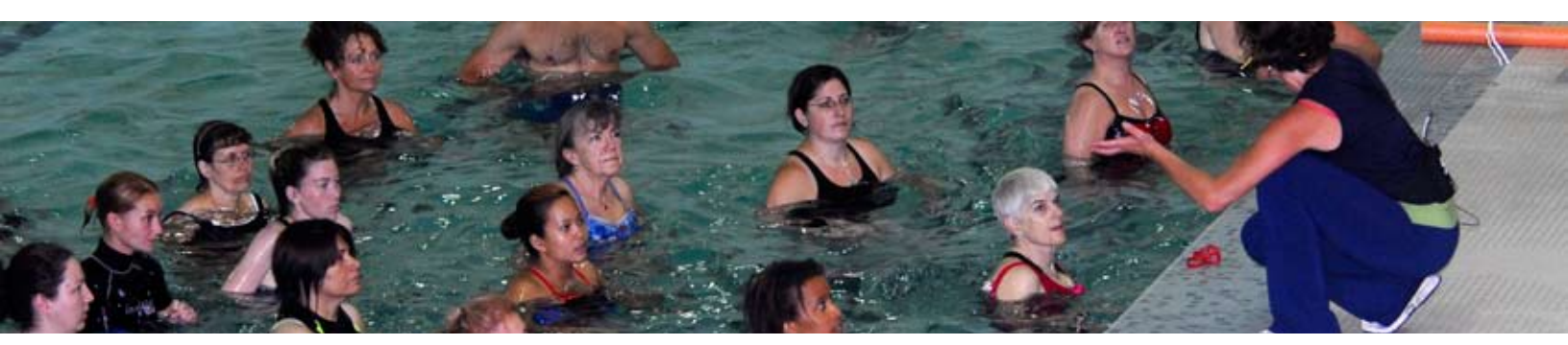
FRIDAY MARCH 25 - OUR SENSATIONAL SESSIONS - Earn 8 CECS

Contact CALA to coordinate the timing. 416 751 9823 or cala_aqua@mac.com